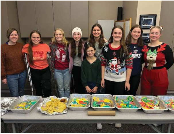
(The Ambassadors along with family members took hand decorated Christmas Cookies to Teresa's Shelter and then went to Stonehill to sing Christmas Carols to the residents).